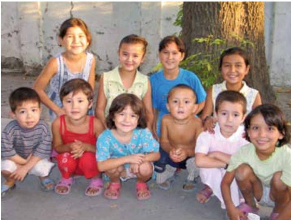
Young believers in Central Asia